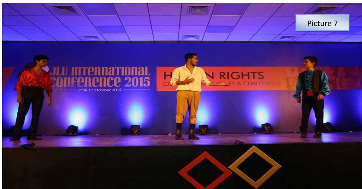
Picture 7 – Students performing ‘Merchant of Venice’ during the cultural event.