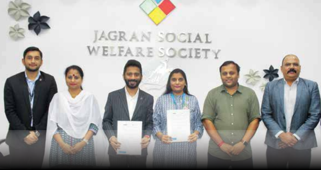
MoU Signing Ceremony of Human Factor Assessment Lab