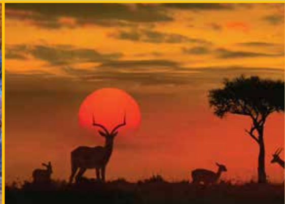
Van Vihar National Park