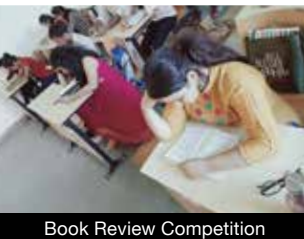
Book Review Competition