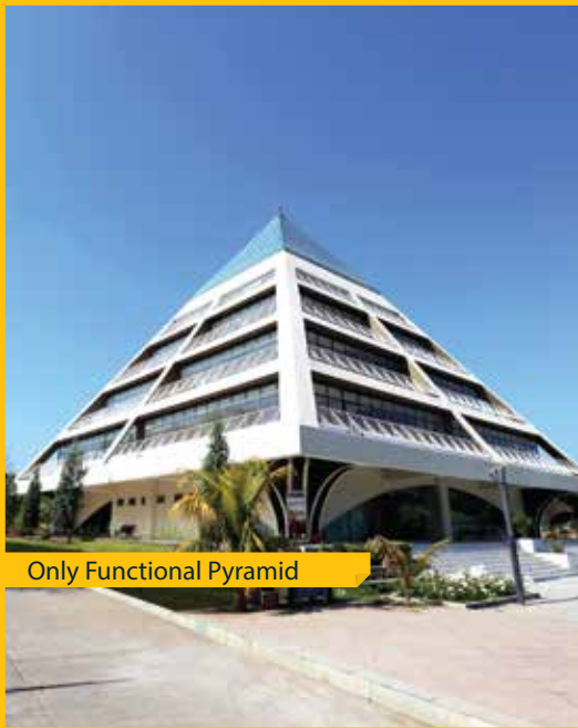
Only Functional Pyramid