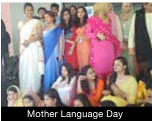
Mother Language Day