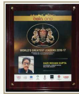
World’s Greatest Leaders 2016-17 International Awards”