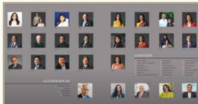
Featured in “21 Leaders - Transforming Indian Education” by EducationWorld in 2020