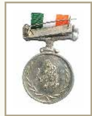
Awarded Karamveer Chakra in 2013