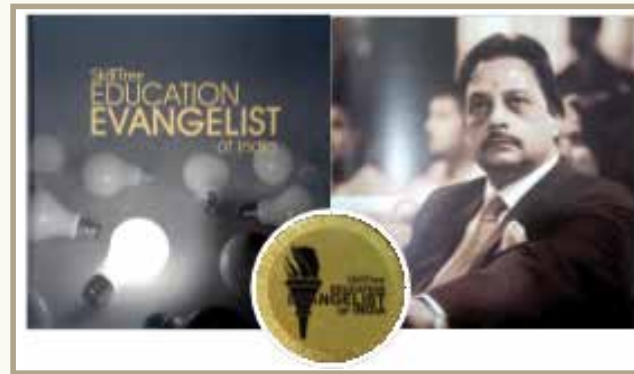
Awarded “Education Evangelists of India” in 2013