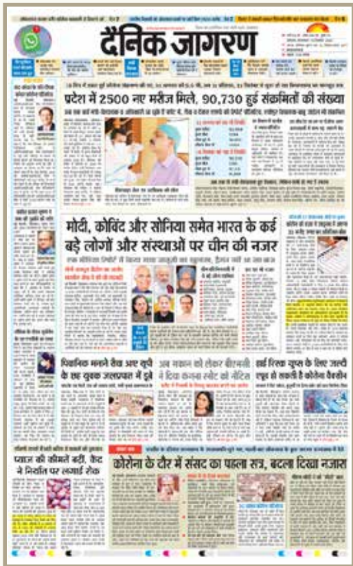
Director & Resident Editor (Owner), Dainik Jagran News Paper, Bhopal Established in 1956